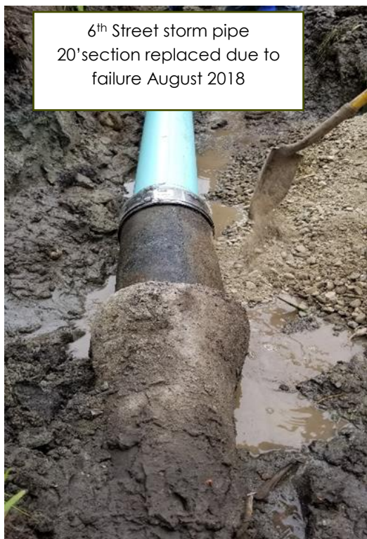
6 th Street storm pipe 20' section replaced due to failure August 2018

ELECTION November 5, 2019 | Design & Engineering 2020 est. | Construction 2021 est.