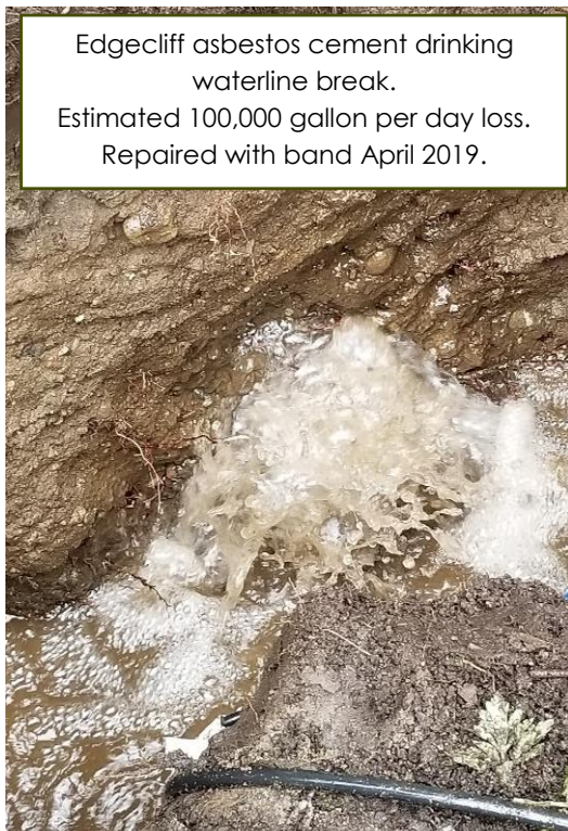
Edgecliff asbestos cement drinking waterline break. Estimated 100,000 gallon per day loss. Repaired with band April 2019.

LANGLEY, LIKE MANY CITIES , continues to be challenged in replacing and upgrading corroded, broken, and aging infrastructure. In 2018, the Mayor formed the Langley Infrastructure Committee to proactively address the City's critical water management utility infrastructure needs and to meet the State Growth Management Act mandates to provide urban services within City Limits. The Committee sought and received information and input from the City staff, the community, the City's financial planner and the City's consulting engineers. After research and analysis, the Committee identified interrelated priority capital improvements to the City's water management utility which are described in the City's 2019 Capital Improvement Projects Engineering Report available online at: