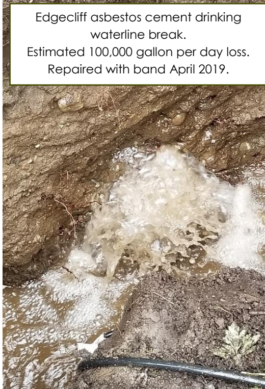
Edgecliff asbestos cement drinking waterline break. Estimated 100,000 gallon per day loss. Repaired with band April 2019.

LANGLEY, LIKE MANY CITIES , continues to be challenged in replacing and upgrading corroded, broken, and aging infrastructure. In 2018, the Mayor formed the Langley Infrastructure Committee to proactively address the City's critical water management utility infrastructure needs and to meet the State's Growth Management Act mandates to provide urban services within City Limits. The Committee sought and received information and input from the City staff, the community, the City's financial planner and the City's consulting engineers. After research and analysis, the Committee identified interrelated priority capital improvements to the City's water management utility which are described in the City's 2019 Capital Improvement Projects Engineering Report available online at: