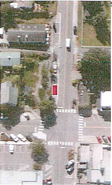
Site 3: 1 parking stall on Second Street, north of Langley Park, adjacent to electric car charging station. Approx. 10'-0" x 20'-0"