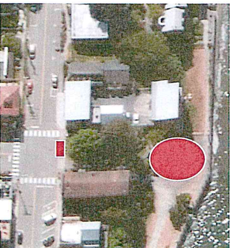
Site 5: Mobile food vehicle zone at Seawall Park landing. Space for 3-4 vehicles in cluster.